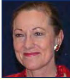
Ms Benita Ferrero-Waldner, Member