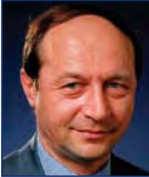
Mr Traian Basescu, President