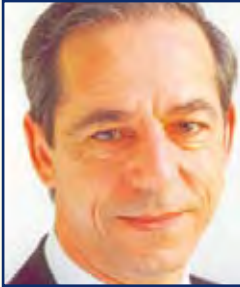
Mr Lawrence Gonzi, Prime Minister