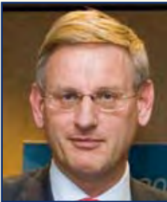
Mr Carl Bildt, Minister for Foreign Affairs