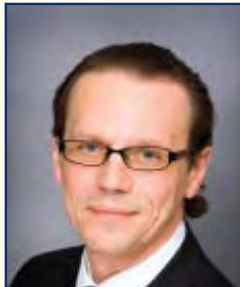
Mr Algirdas Šemeta, Minister for Finance