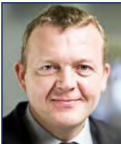
Mr Lars Løkke Rasmussen, Minister for Finance