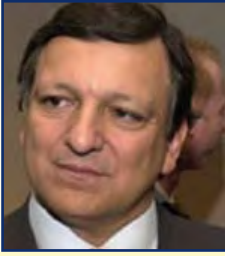
Mr José Manuel Barroso, President