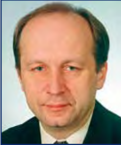
Mr Andrius Kubilius, Prime Minister