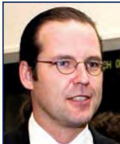
Mr Anders Borg, Minister for Finance