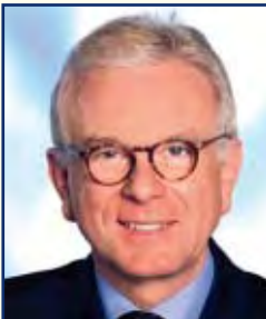
Mr Hans-Gert Pötering, President