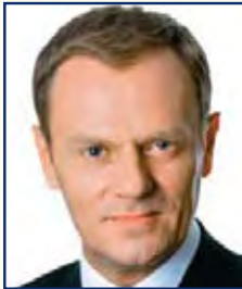
Mr Donald Tusk, Prime Minister