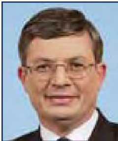
Mr Tonio Borg, Deputy Prime Minister and Minister for Foreign Affairs