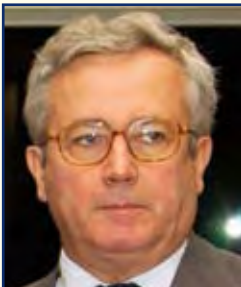
Mr Giulio Tremonti, Minister for Economic Affairs and Finance