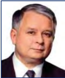
Mr Lech Kaczynski, President of the Republic