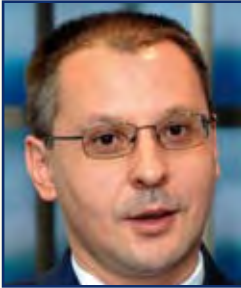
Mr Sergei Stanishev,