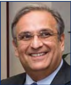
Mr Ioannis Papathanasiou, Minister for Economic Affairs and Finance