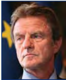
Mr Bernard Kouchner, Minister for Foreign and European Affairs