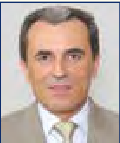
Mr Plamen Oresharski,

Deputy Prime Minister and Minister for Foreign Affairs