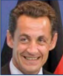
Mr Nicolas Sarkozy, President of the Republic