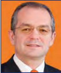
Mr Emil Boc, Prime Minister