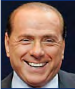
Mr Silvio Berlusconi, Prime Minister