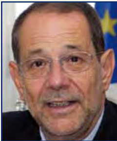
Mr Javier Solana, Secretary General/High Representative