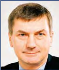
Mr. Andrus Ansip, Prime Minister