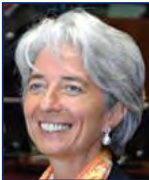
Ms Christine Lagarde, Minister for Economic Affairs, Industry and Employment