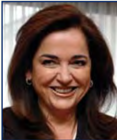
Ms Dora Bakoyannis, Minister for Foreign Affairs