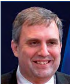
Mr Ivailo Kalfin,

Deputy Prime Minister and Minister for Foreign Affairs