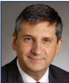
Mr Michael Spindelegger, Federal Minister for European and International Affairs