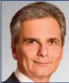
Mr Werner Faymann, Federal Chancellor