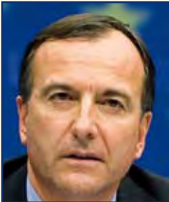
Mr Franco Frattini, Minister for Foreign Affairs