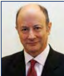
Mr Jan Vincent-Rostowski, Minister for Finance