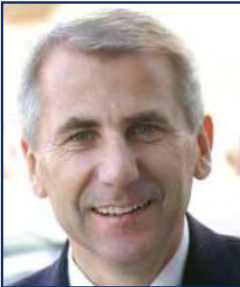
Mr Vygaudas Usackas, Minister for Foreign Affairs