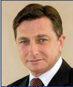
Mr Borut Pahor, Prime Minister