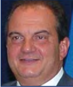
Mr Kostas Karamanlis, Prime Minister