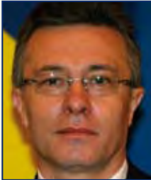
Mr Cristian Diaconescu, Minister for Foreign Affairs