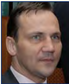
Mr Radosław Sikorski, Minister for Foreign Affairs