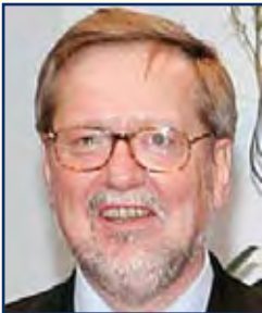
Mr Per Stig Møller, Minister for Foreign Affairs