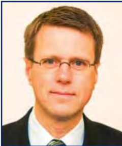
Mr Samuel Žbogar, Minister for Foreign Affairs