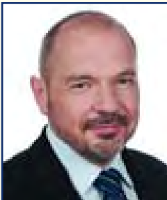
Mr Franc Križanič, Minister for Finance