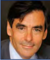
Mr François Fillon, Prime Minister