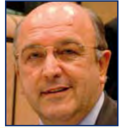
Mr Joaquín Almunia, Member