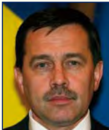
Mr Gheorghe Pogea, Minister for Public Finance