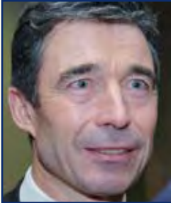
Mr Anders Fogh Rasmussen, Prime Minister