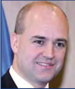
Mr Fredrik Reinfeldt, Prime Minister